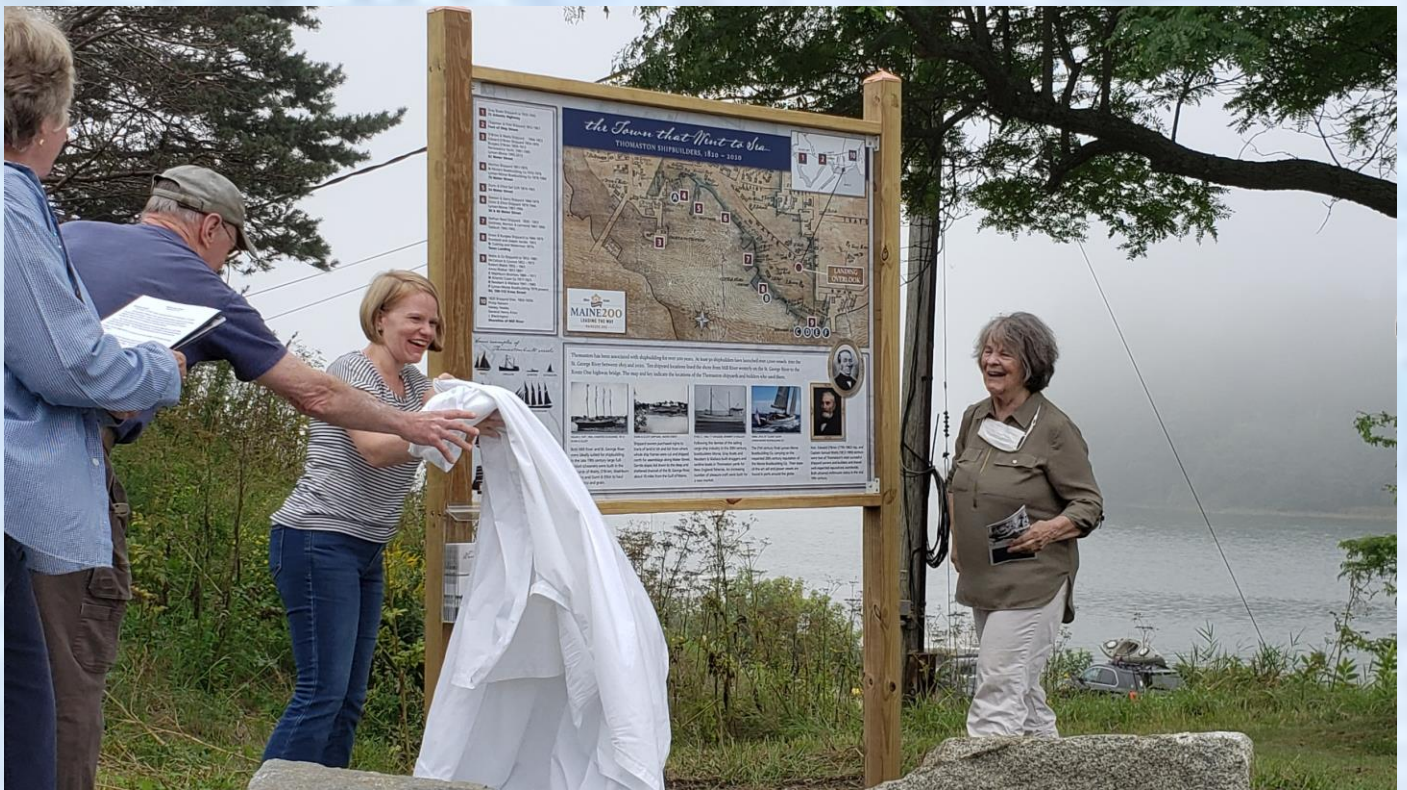
Dedication of Shipbuilders Plaque on town landing, August 21st.

With reopening the museum we have had a greater number of visitors than in pre-pandemic years. Donations and research requests continue to be higher than usual also. Some of the latter are the continued impact of house cleaning during the pandemic, but also there are many new people moving to town that want to learn more about their new abode and Thomaston.